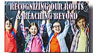
"Recognizing Our Roots & Reaching Beyond"

100TH ANNUAL STATE EDUCATION CONFERENCE November 14-16 | La Vista